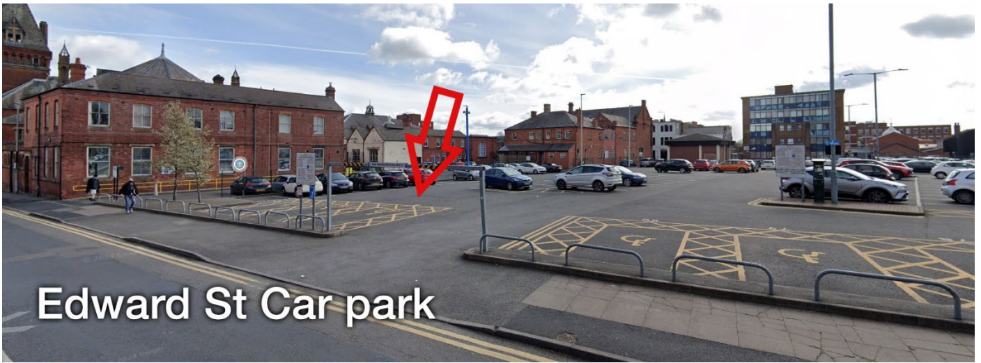
Edward St Car park